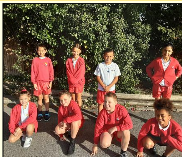
House Captains and Vice Captains