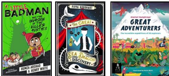
KS2 books available to win.