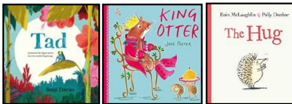
KS1 books available to win.

In the wake of the Book Fair and our reading event in aid of Comic Relief, we wanted to share with you some exciting news of a Book Competition for the children at Wray Common. You have the chance to win 1 of 3 specially chosen books that are not currently available in our libraries. All you have to do to be in with a chance of winning, is READ. If you read 4 or more times in a week, your teacher will give you a special raffle ticket. That raffle ticket can be taken to the school library and placed in the envelope of the book you would like to win. The more times you read, the more chances you get to enter. The competition will run over the next 4 weeks, with the winners drawn on Friday 13 th December during our Celebration Assembly. So, on your marks, get set .....READ!