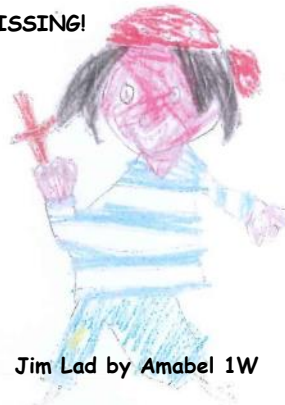
Jim Lad by Amabel 1W