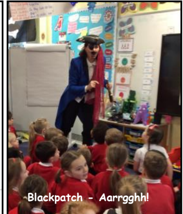
Blackpatch - Aarrghhh!