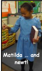
Matilda ... and new!