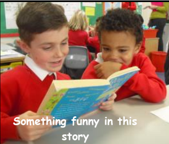
Something funny in this story