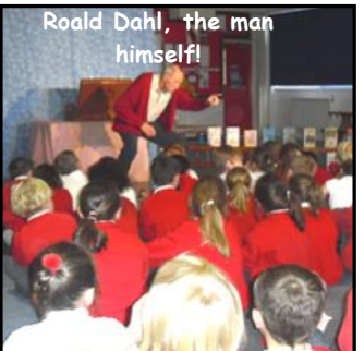
Roald Dahl, the man himself!