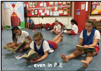
... even in P.E