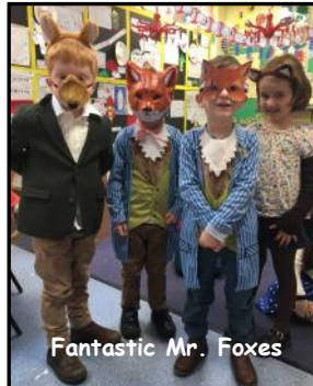
Fantastic Mr. Foxes