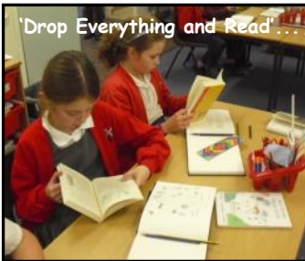
'Drop Everything and Read'...