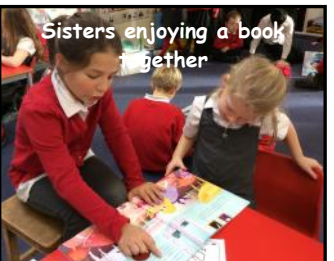
Sisters enjoying a book together