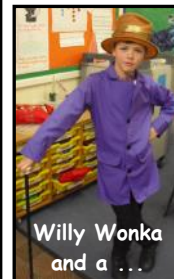
Willy Wonka and a ...