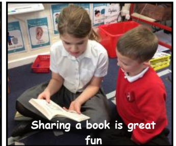
Sharing a book is great fun