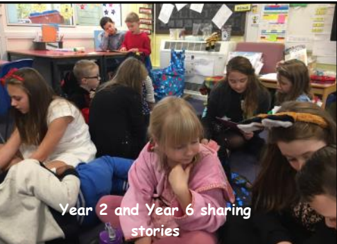
Year 2 and Year 6 sharing stories